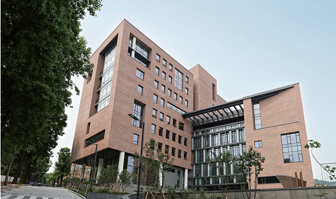
B1 Auditorium, Lee Youn Jae Hall, Yonsei University, Seoul, of Korea Address: Lee Youn Jae Hall, Yonsei University, 50 Yonsei-ro, Seodaemun-gu, Seoul, Korea